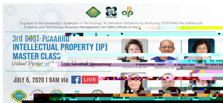
Poster for the launching of the IP Master Class

The said Master Class was conducted as part of the Support to the University's Strategies in Technology Acceleration Initiatives by Nurturing the Intellectual