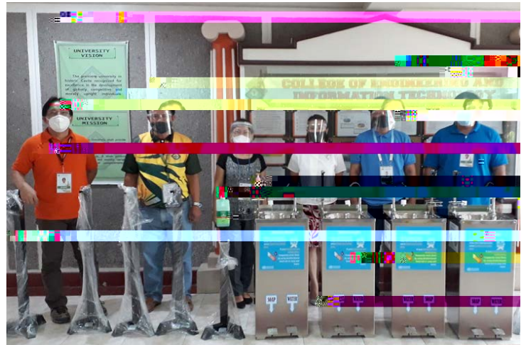
CvSU officials and employees during the unveiling